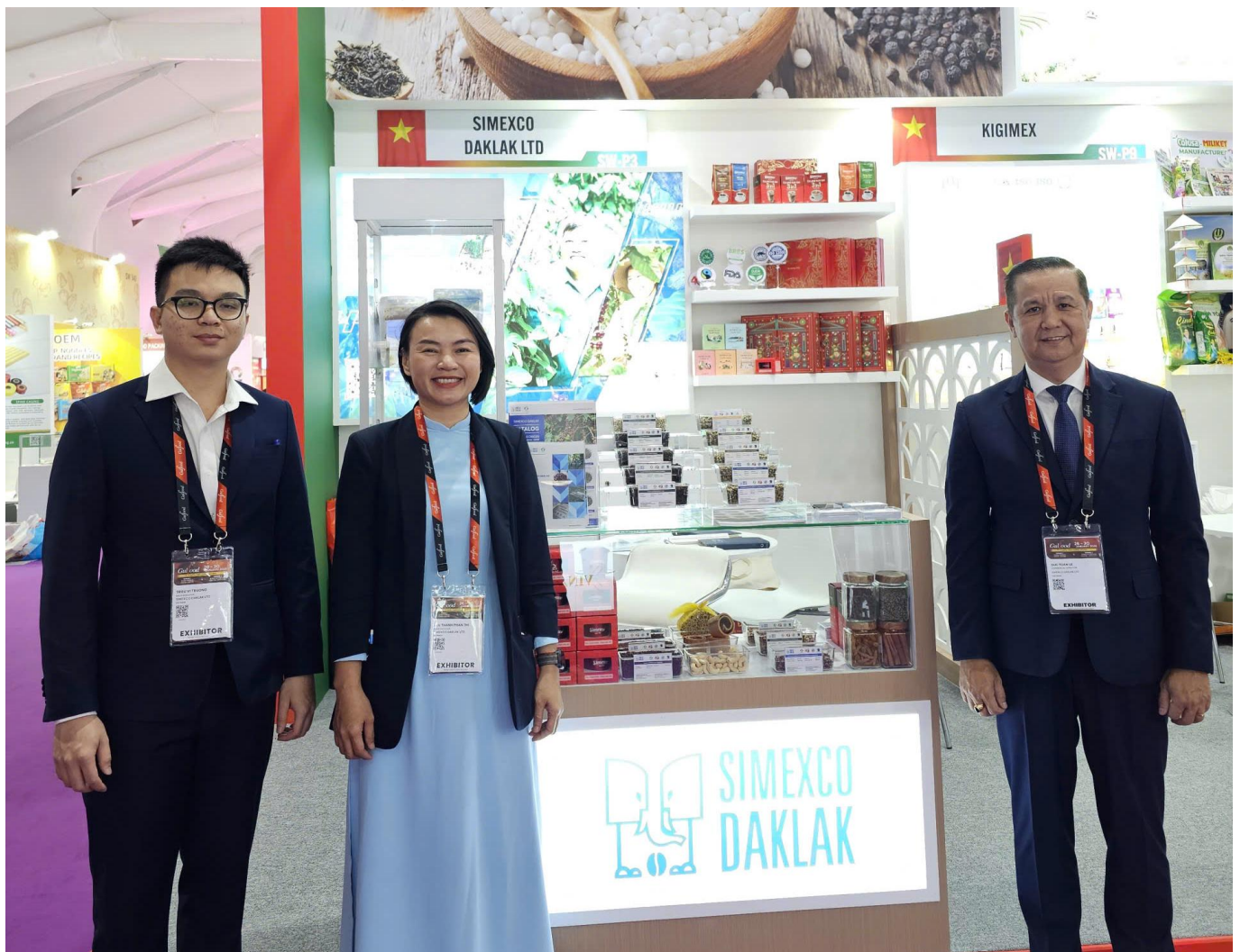
Simexco DakLak's booth at Gulfood 2026

In January 2026, Simexco Daklak, Vietnam's leading exporter of robusta coffee and black pepper, is set to participate in Gulfood Dubai 2026 (January 26-30), the world's largest food and beverage exhibition, showcasing Vietnamese products and advancing market penetration in the Middle East.