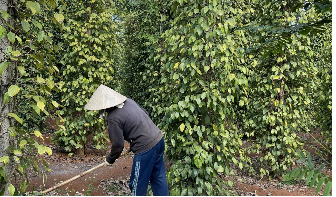
Farmer clearing their garden