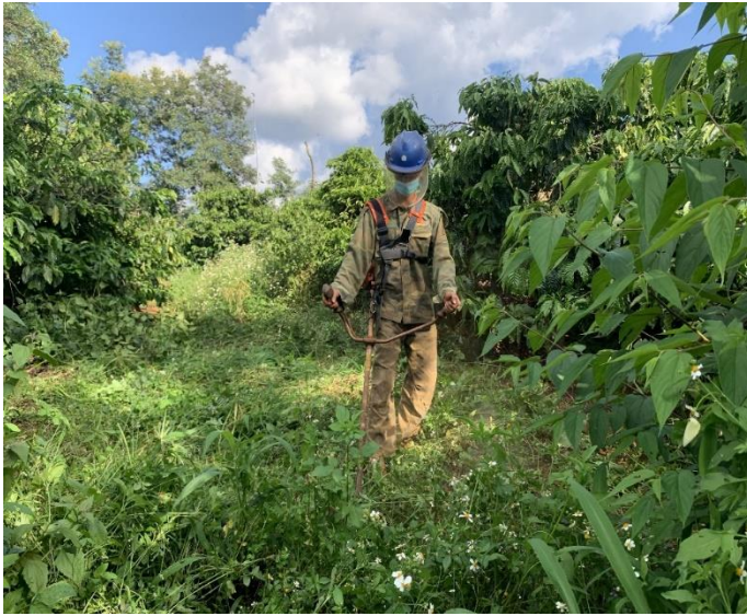
Weed-cutting machine as the alternative way of weed management