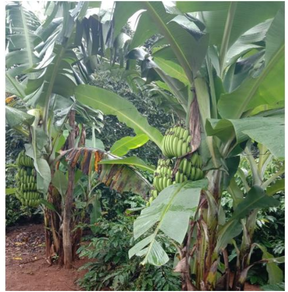
Banana provided under ISLA program has set many fruits