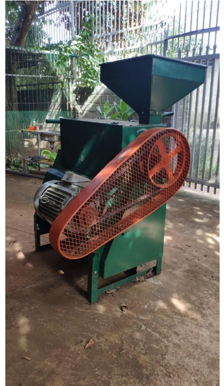
Coffee hulling machine was delivered to farmers to improve coffee quality