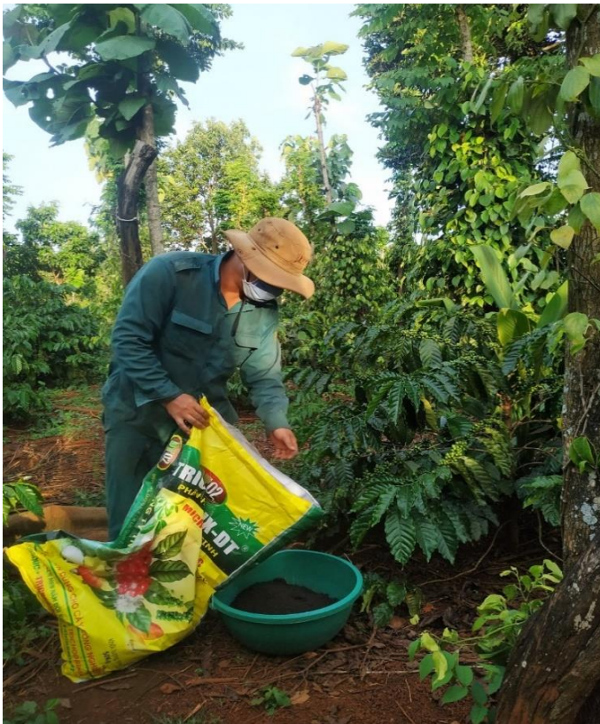
Farmers applied fertilizers to enhance the fruit growth and crop nutrient