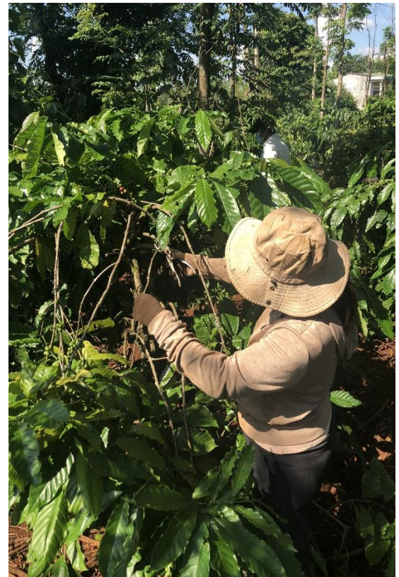
Pruning to remove broken and damaged branches